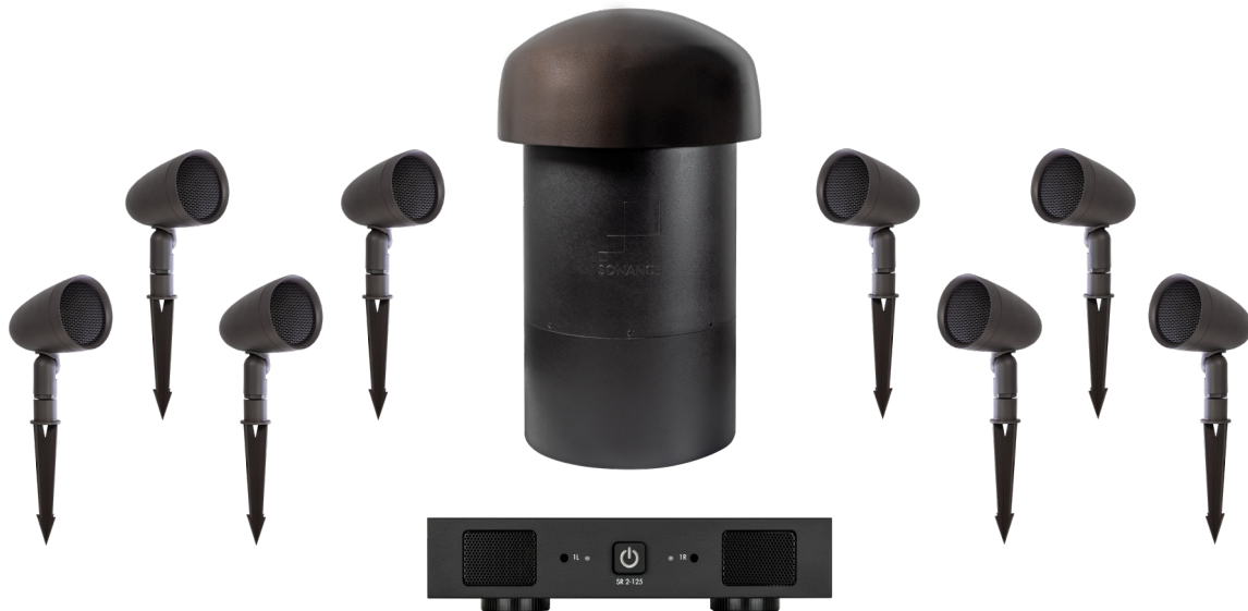
SGS System SKU 93433

8 SGS SATELLITES | 8 GROUND STAKES | 1 SGS SUBWOOFER | 1 2-125 AMPLIFIER